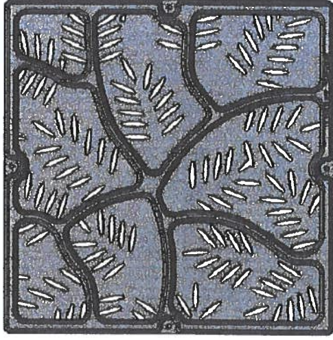
BACK scale 1:9