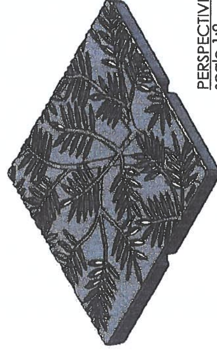
PERSPECTIVE scale 1:9